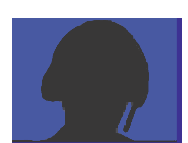
11/12/03 Caporale AlessandroCarrisi 23 Trepuzzi, Lecce Italy Killed in Nasiriyah when an I.E.D. exploded in the Italian paramilitary installation 6/o Transp. Regiment Italy