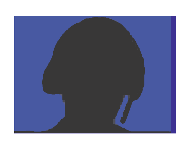
11/12/03 Tenente Massimiliano Ficuciello 35 Italy Killed in Nasiriyah when an I.E.D. exploded in the Italian paramilitary installation Regular Army Italy