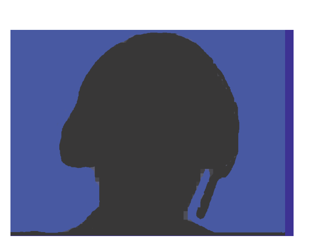
11/12/03 Maresciallo Capo Massimiliano Bruno 40 Bologna Italy Killed in Nasiriyah when an I.E.D. exploded in the Italian paramilitary installation Ris (Investigative Unit) Italy