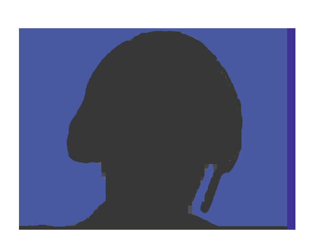
11/12/03 Caporal Maggiore Emanuele Ferraro 28 Carlentini, Siracusa Italy Killed in Nasiriyah when an I.E.D. exploded in the Italian paramilitary installation 6/o Transp. Reg. Italy